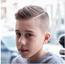
Not an even length