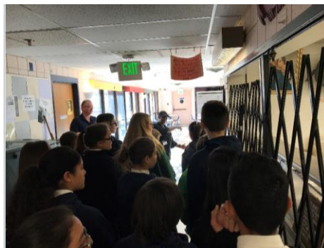
The Sam House Kitchen

Thank you 7 th Grade for your example of living Serviam and for your willingness to become 'good Samaritans' this Christmas season.