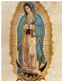
Feast of Our Lady of Guadalupe - Dec. 12

For more information visit samhousedenver.org